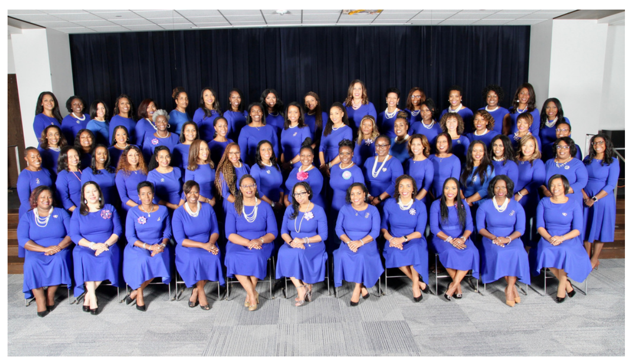
The Mothers of the Charlotte Chapter Jack and Jill

The Charlotte Chapter of Jack and Jill was established in 1957 and recently celebrated 65 years of service to the community, enhancing the lives of ALL children and families while being dedicated to raising the next generation of African American leaders.